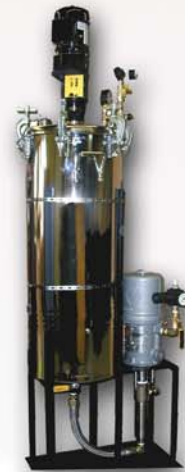
Agitated pressure tank with transfer pump