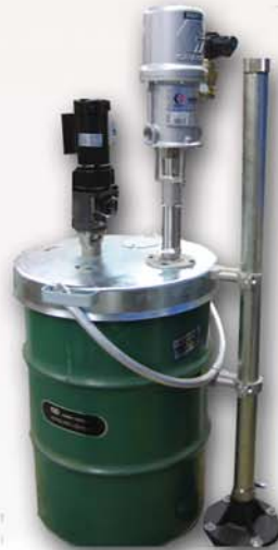
55-Gallon transfer pump with agitator and pneumatic lift