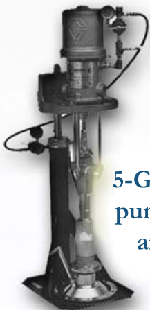
5-Gallon ram inducted pump used with paste and high viscosity materials