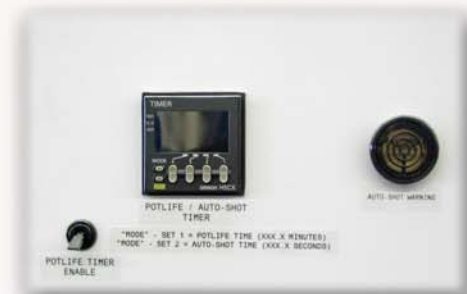
Pot life timer prevents material from curing in the mixer

Ashby Cross Company 28 Parker Street, Newburyport, MA 01950 978-463-0202 www.ashbycross.com