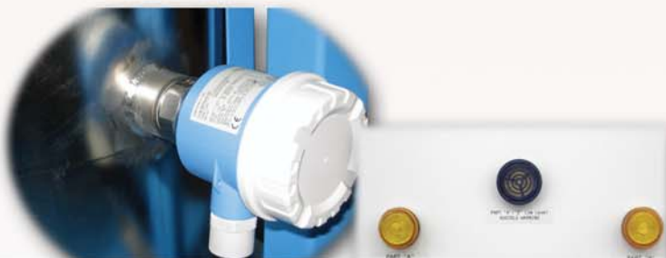
Ultrasonic level sensors are highly reliable, unaffected by materials and provide alarm to prevent running dry