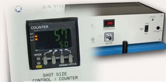
Volumetric (measured) shot size controlled by encoder assures accurate, repeatable dispensing. Minimum shot size achievable is machine dependent