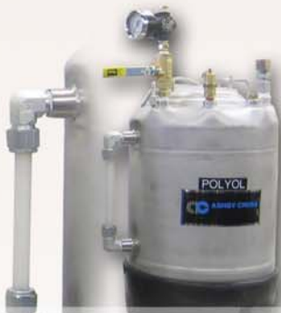
Sight tubes for visual level detection