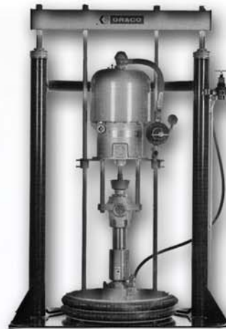
55-Gallon ram inducted pump used with paste and high viscosity materials