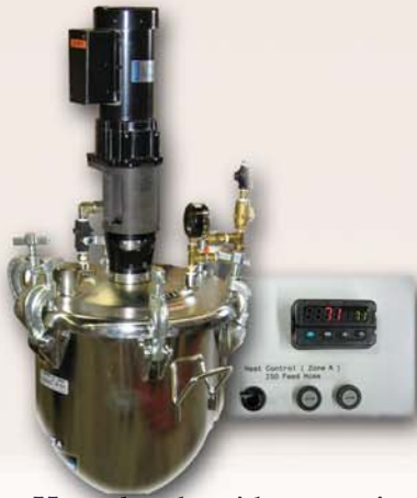
Heated tanks with proportional control

50 RPM, electric motor driven agitators with dynamic seals allow vacuum to 2 Torr, assure uniform heat distribution, degass, and solids suspension