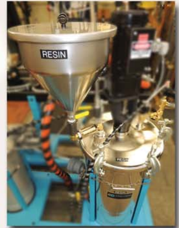
Remote Tank Fill

Portable cart adds flexibility in production layout - simplifies maintenance - consolidates all components onto one platform