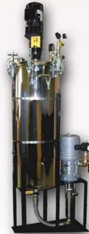
Agitated pressure tank with transfer pump