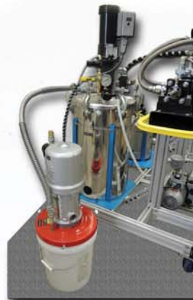
Bulk feed directly from containers