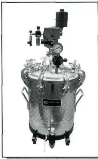
PRESSURE/VACUUM TANK WITH AGITATOR