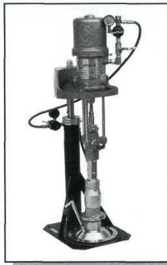
5 GALLON RAM PUMP