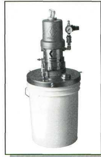
5 GALLON PAIL PUMP