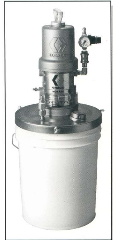
5-GALLON PAIL PUMP