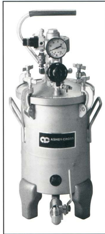
2-GALLON VACUUM PRESSURE TANK